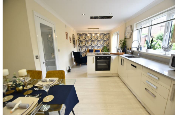
LIVING KITCHEN DINER