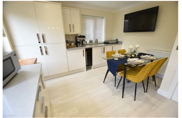
LIVING KITCHEN DINER