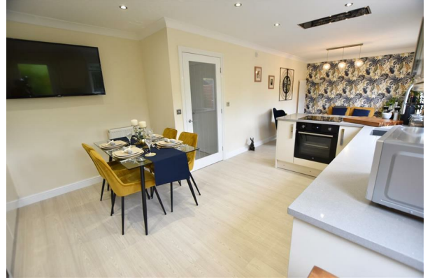
LIVING KITCHEN DINER SEATING AREA